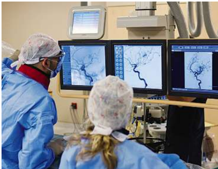
Minimally invasive procedures, such as aneurysm coiling, rely on advanced diagnostic imaging equipment to guide instruments through the patient's blood vessels.

"Having said that, it is a very selective process by which patients are chosen for the coiling procedure," she says. "It depends on their clinical situation and their overall health condition, among other factors."