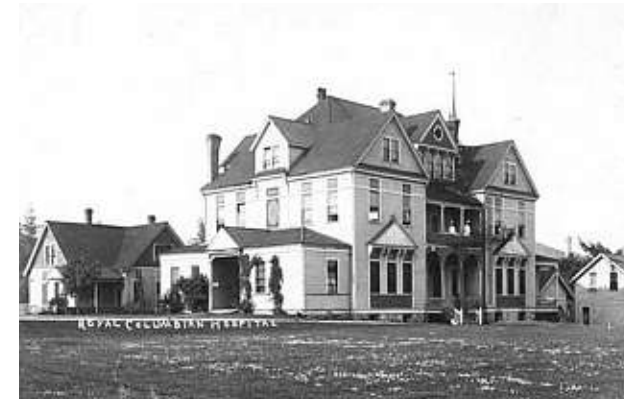
RCH in its Sapperton location in New Westminster in 1889.

Tell us your story! Whether you were born, treated, or worked at RCH, we want to hear from you! Send your words, video or photos to: RCH150@fraserhealth.ca