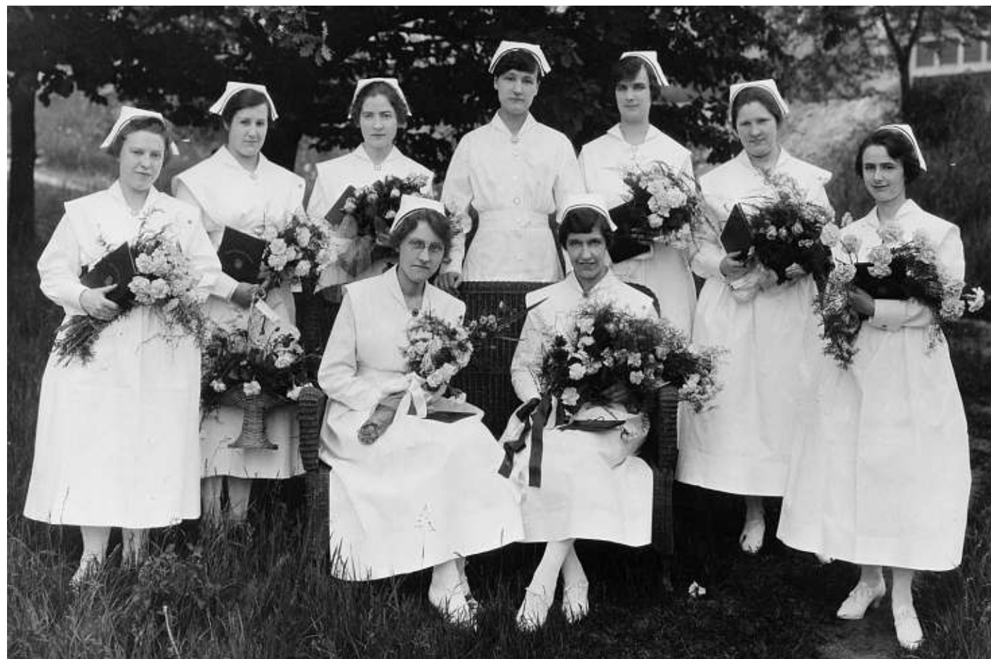
RCH nurse graduating class of 1925. RCH housed a nursing school between 1901 and 1978. Today, RCH is a Clinical Academic Campus affiliated with UBC’s Faculty of Medicine.