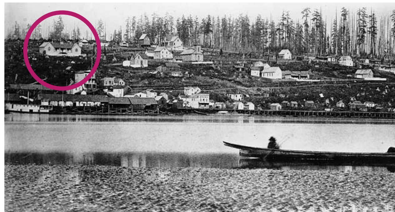
The original RCH (circled), as it was built in 1862, located at Agnes and Clement (now 4th) Streets in New Westminster. The first hospital on the mainland of British Columbia, it had 30 beds and primarily served men.

Fyvie and Constable suggest that the patient would receive an x-ray and an abdominal lavage would have been conducted to test for internal bleeding. If the patient was considered unstable, they would be taken to the operating room for exploratory surgery of the abdomen. An injured spleen would then be removed.