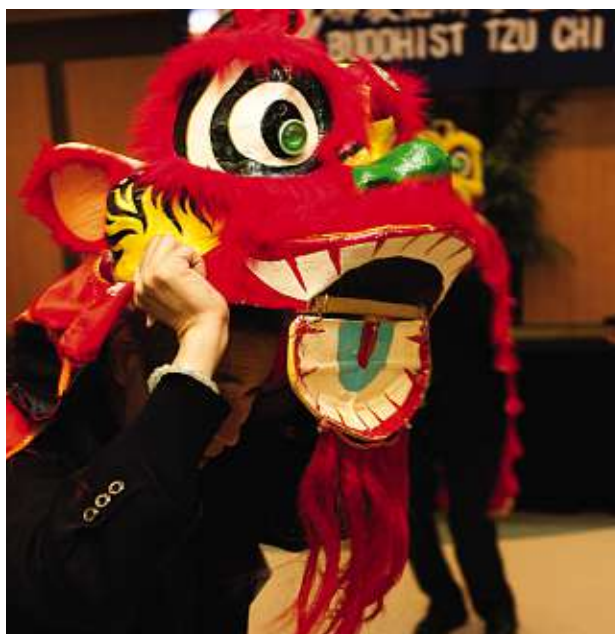
Year of the Dragon: Tzu Chi Foundation celebrates with gift to RCH Foundation's Multipurpose Interventional Suite campaign.