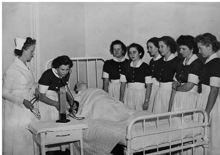
Using a mannequin to train nursing students on how to measure a patient’s blood pressure, circa 1930s.